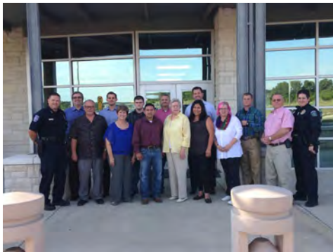
Class 13 of the Leander Citizens Police Academy