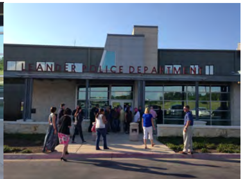
Class 13 Graduates and invited guests filing into the Leander Police Station for the Ceremony