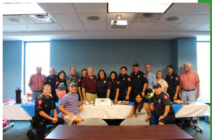
Clyde's Other Family!!