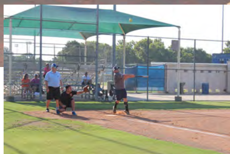
Gully's foul ball stance