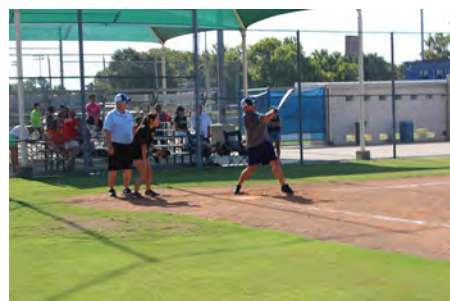
Schiller's power swing