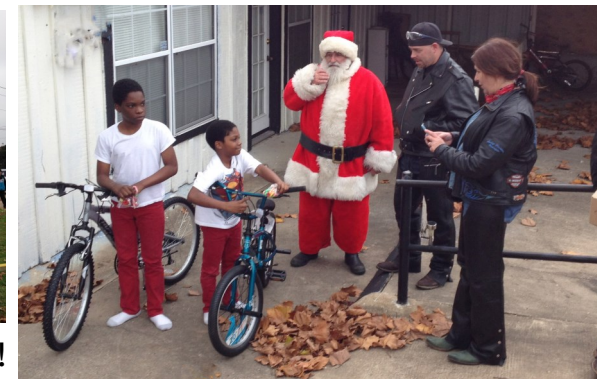
Another successful Toy Run for the Lake Loons and COPs!!

Children's & parents' happy faces, bikes, big wheels, lots of presents; and even Christmas Dinner!