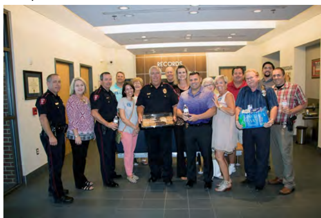
Below: Once again Wal-Mart showed it's appreciation to our department for the fine protection of their store and of Brenham, with a nice lunch. There was a large contingent of Officers and Staff ready to show their appreciation, by eating it all!