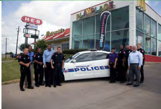
Above: All is well with BPD and McDonalds