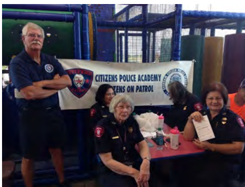
My fingerprinting Crew at McDonalds doing just a little bit of work (we printed 42 children) Then the fun began. It started at the photo booth and ended with burgers and fries. All in all, a good day! Good Job Guys!