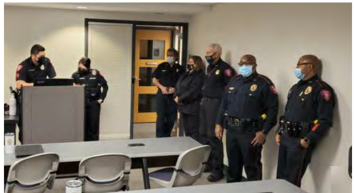
Right: Waiting for CPA Class 35 to officially start. All COP's present were introduced to the class.