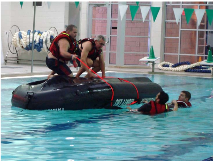
EMS boat training