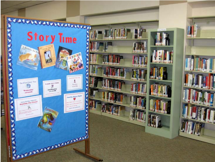
Story Time board