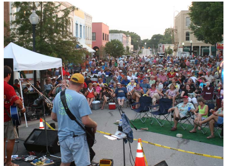
Hot Nights, Cool Tunes

With an ambitious program of work for 2010, Main Street and Community Development succeeded with a solid year and new highs. The year saw a high in reinvestment in downtown, in terms of both money ($3,318,386) and in volunteer hours logged (1,168). This investment and the continuous effort to encourage visitation to our community provided a successful value with eight new business starts, expansions and relocations, and 14 downtown redevelopment projects. With a strong central business district being a visual indicator of the economic condition of a community, our community presents a solid local economy.