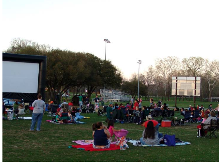
Movies in the Park