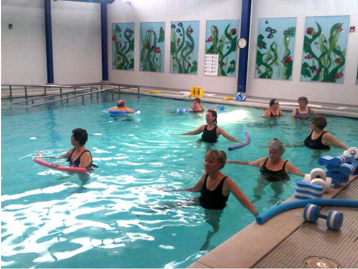
Therapy pool patrons