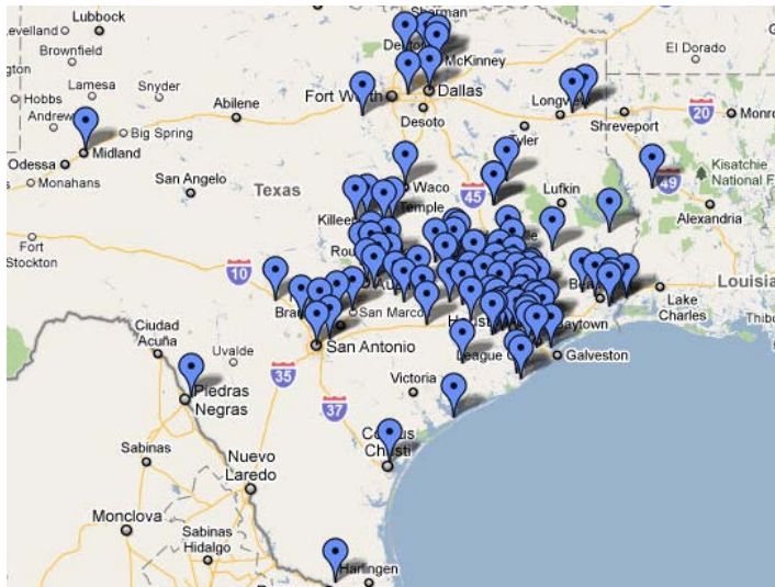
They come to Brenham

Estimated dollars spent by visitors involved with 2010 Blue Diamond Baseball tournament