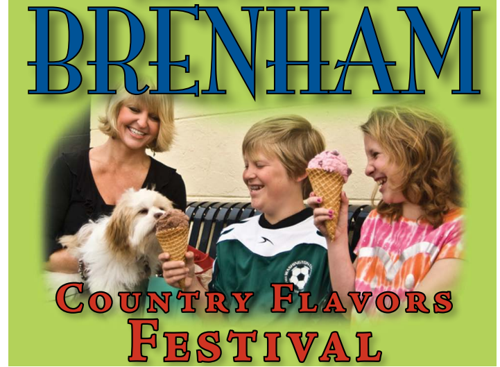
Country Flavors Festival Advertisement