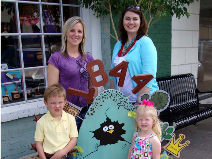
Spring Egg Art Walk