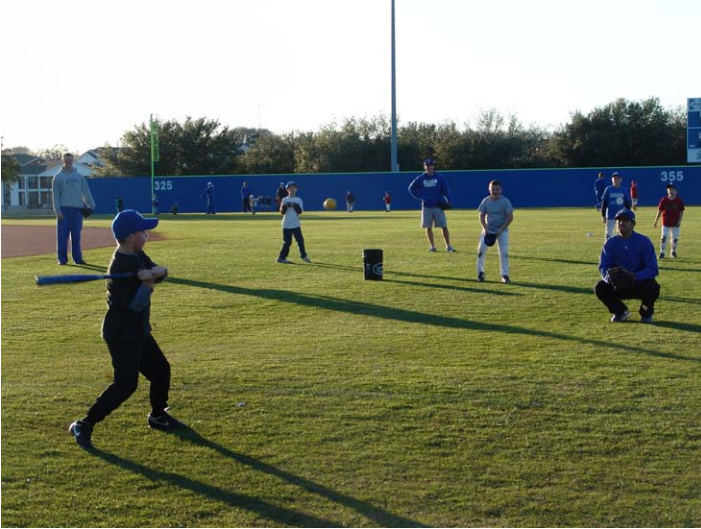
Spring Training Camp