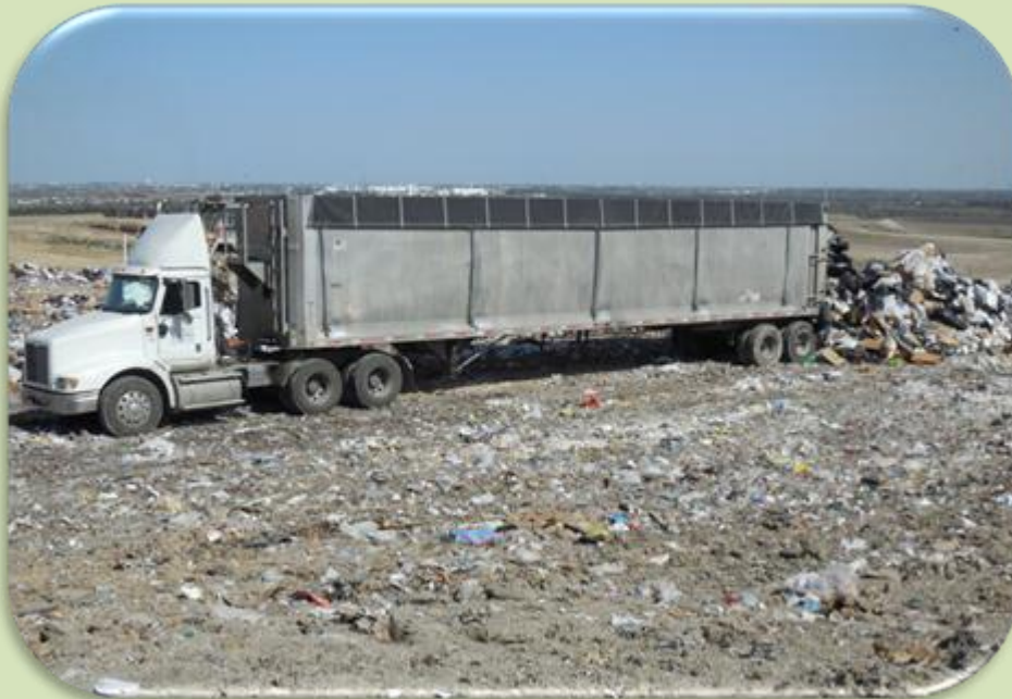
Sunset Farms Landfill