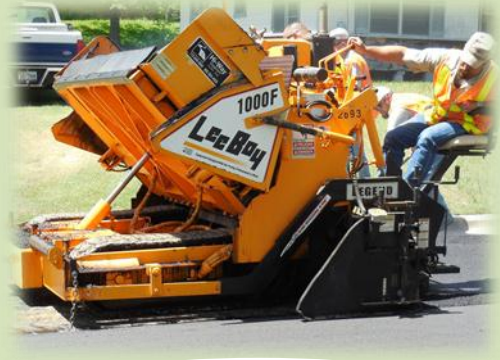
Hot mix on Jefferson