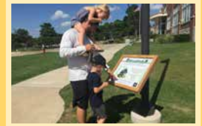
StoryWalk in Fireman's Park