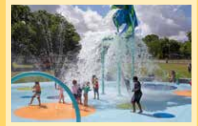
Splash Pad in Henderson Park