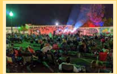
Hot Nights Cool Tunes Texas Arts & Music Festival