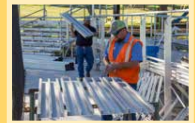
Henderson Field in Henderson Park