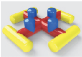
X MARKS THE SPOT