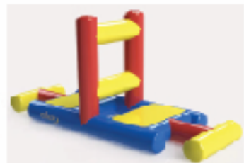
HOLE IN THE WALL