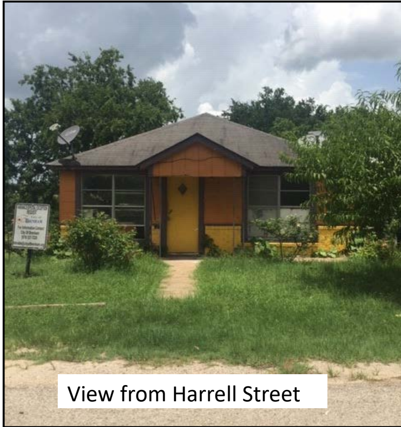
View from Harrell Street