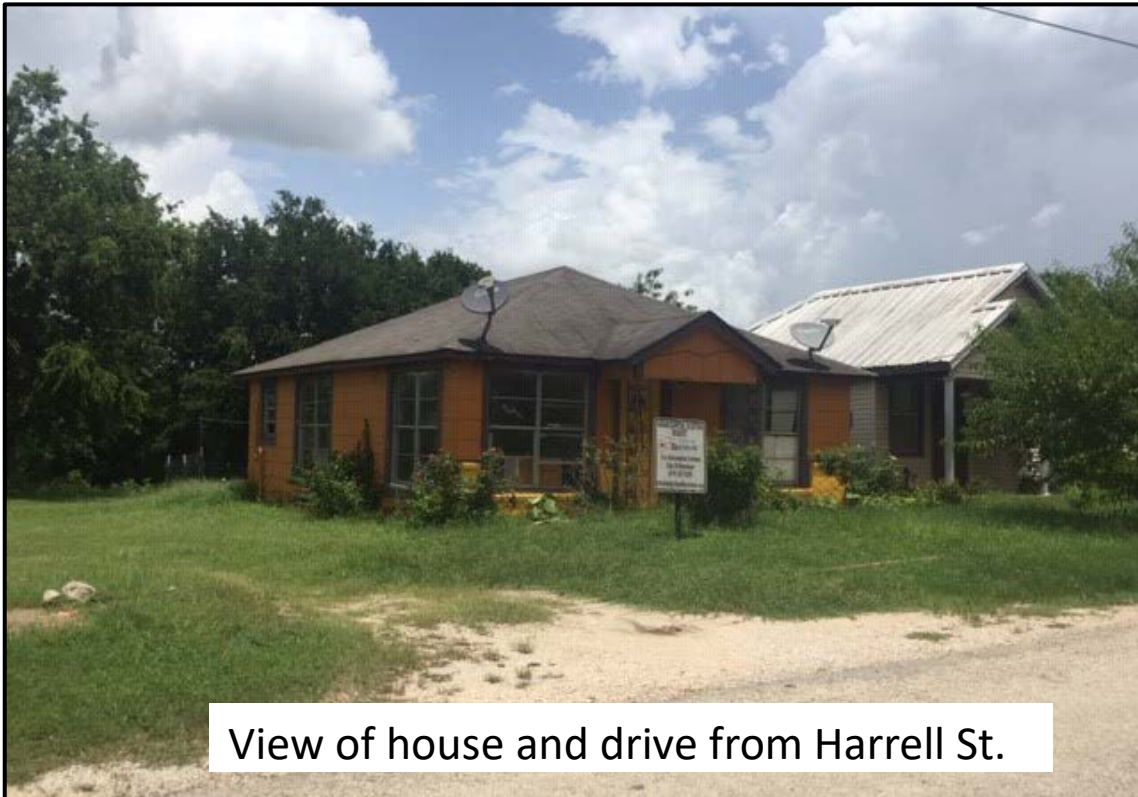
View of house and drive from Harrell St.