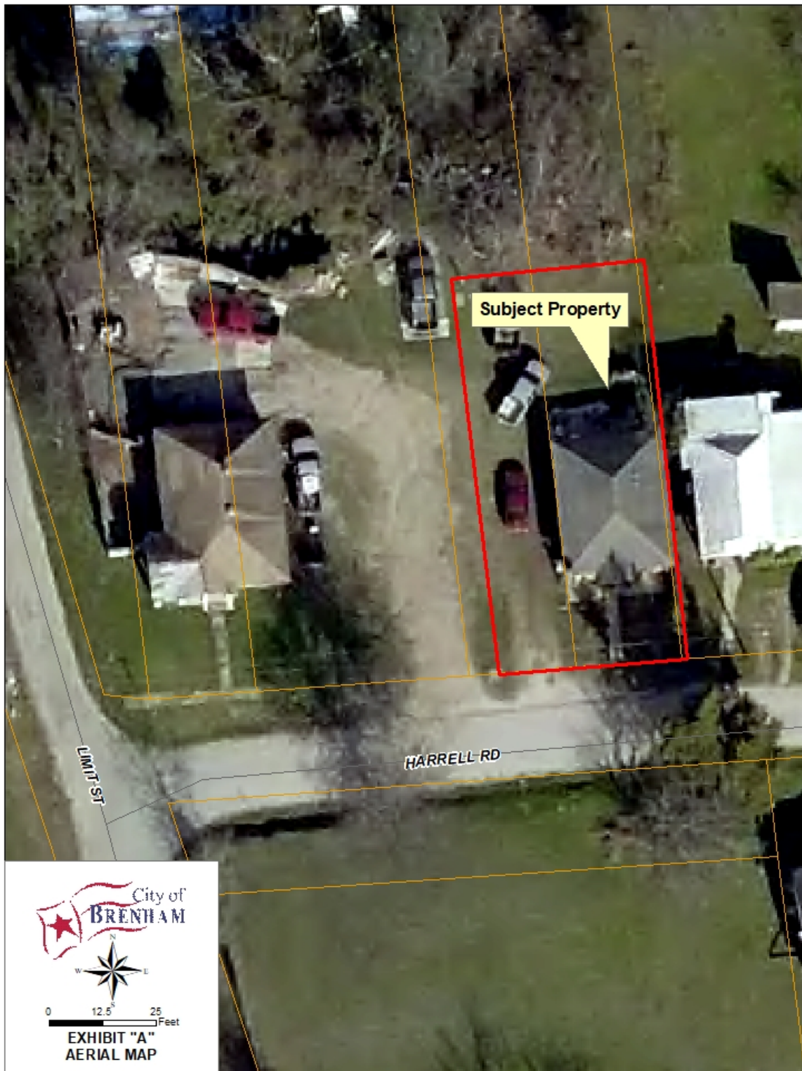
EXHIBIT "A" AERIAL MAP