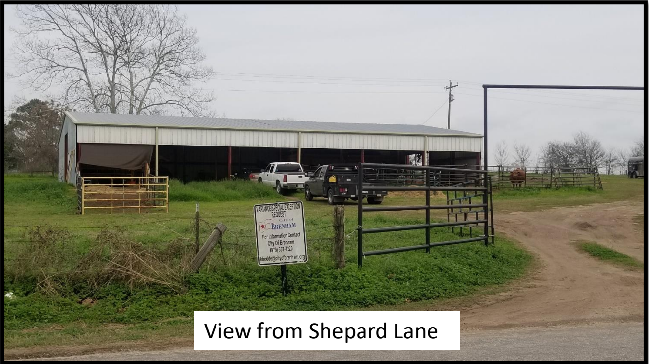
View from Shepard Lane