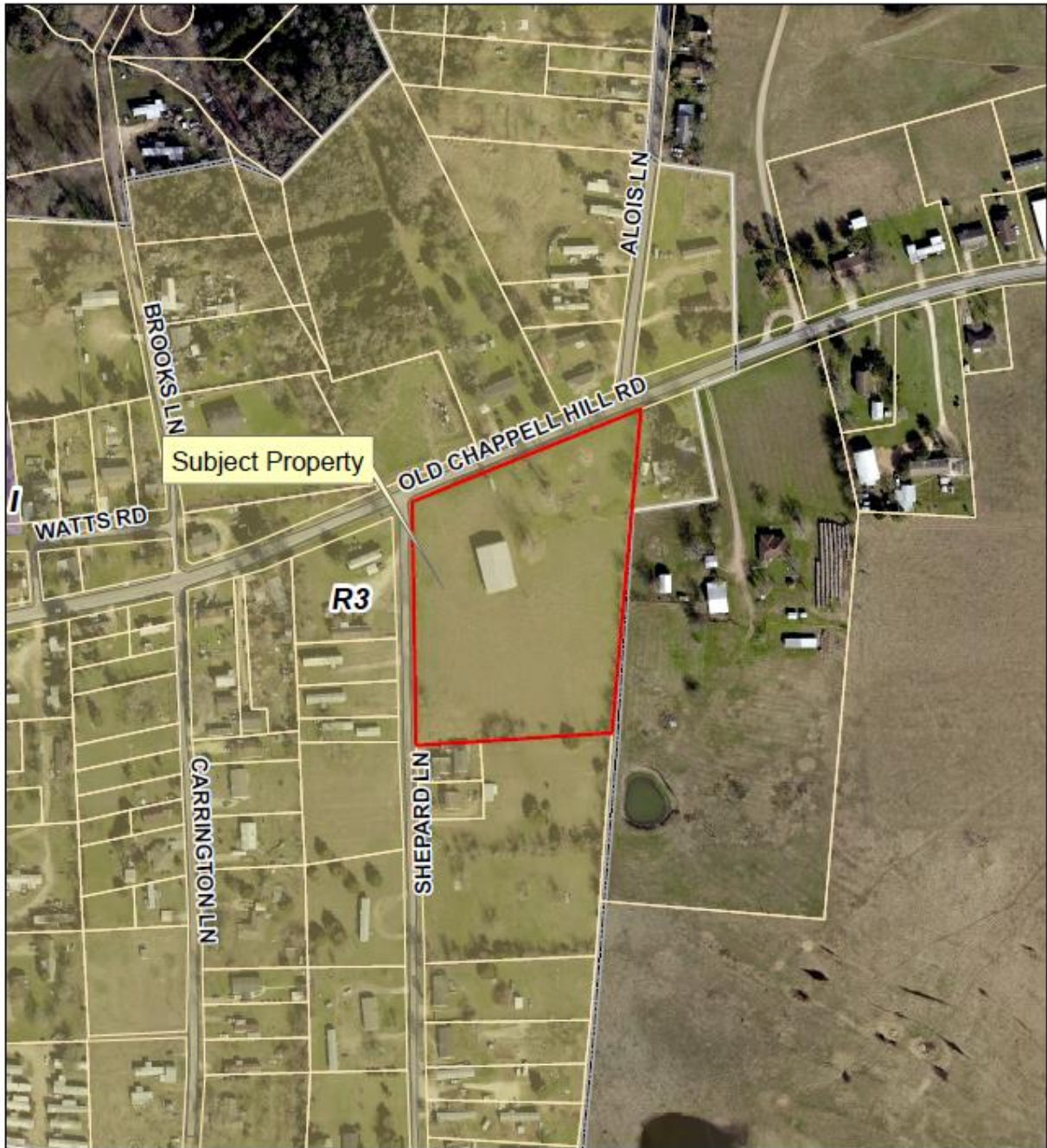
EXHIBIT "A" AERIAL MAP