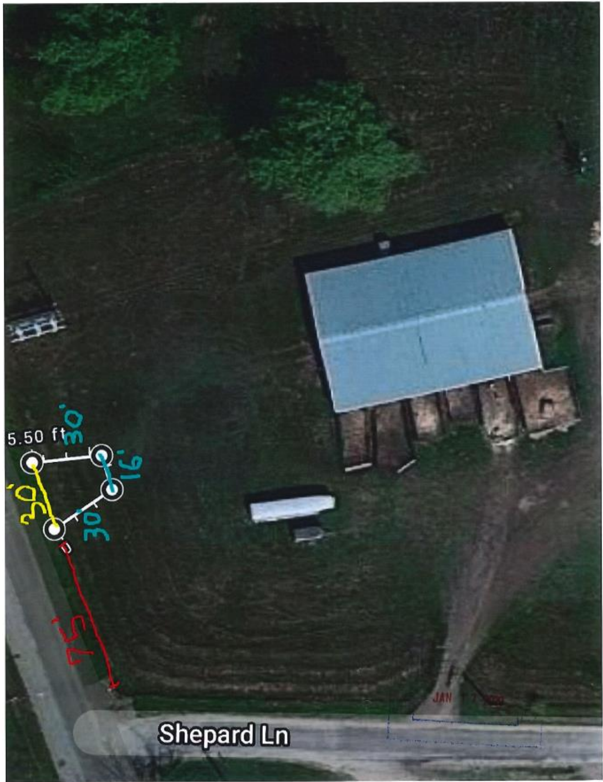
Proposed location of culvert