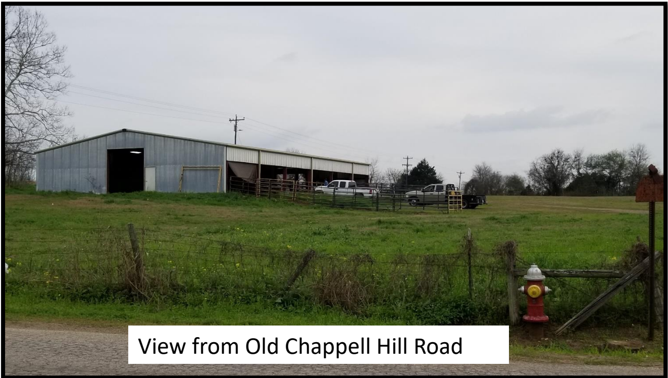
View from Old Chappell Hill Road