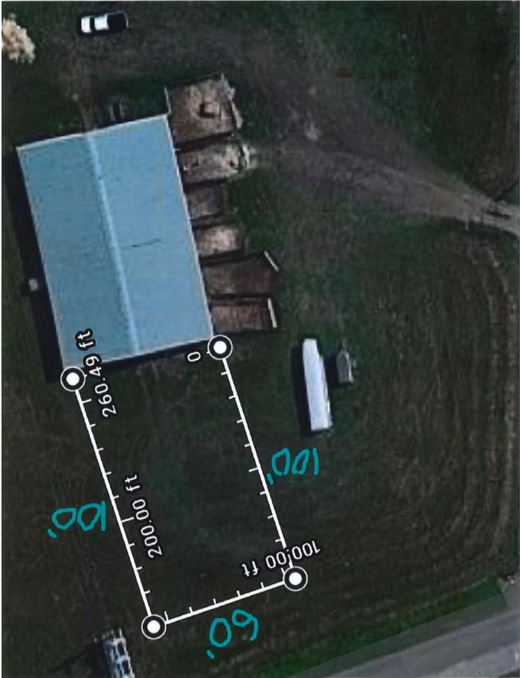
Proposed Gravel Area (6000 sf)