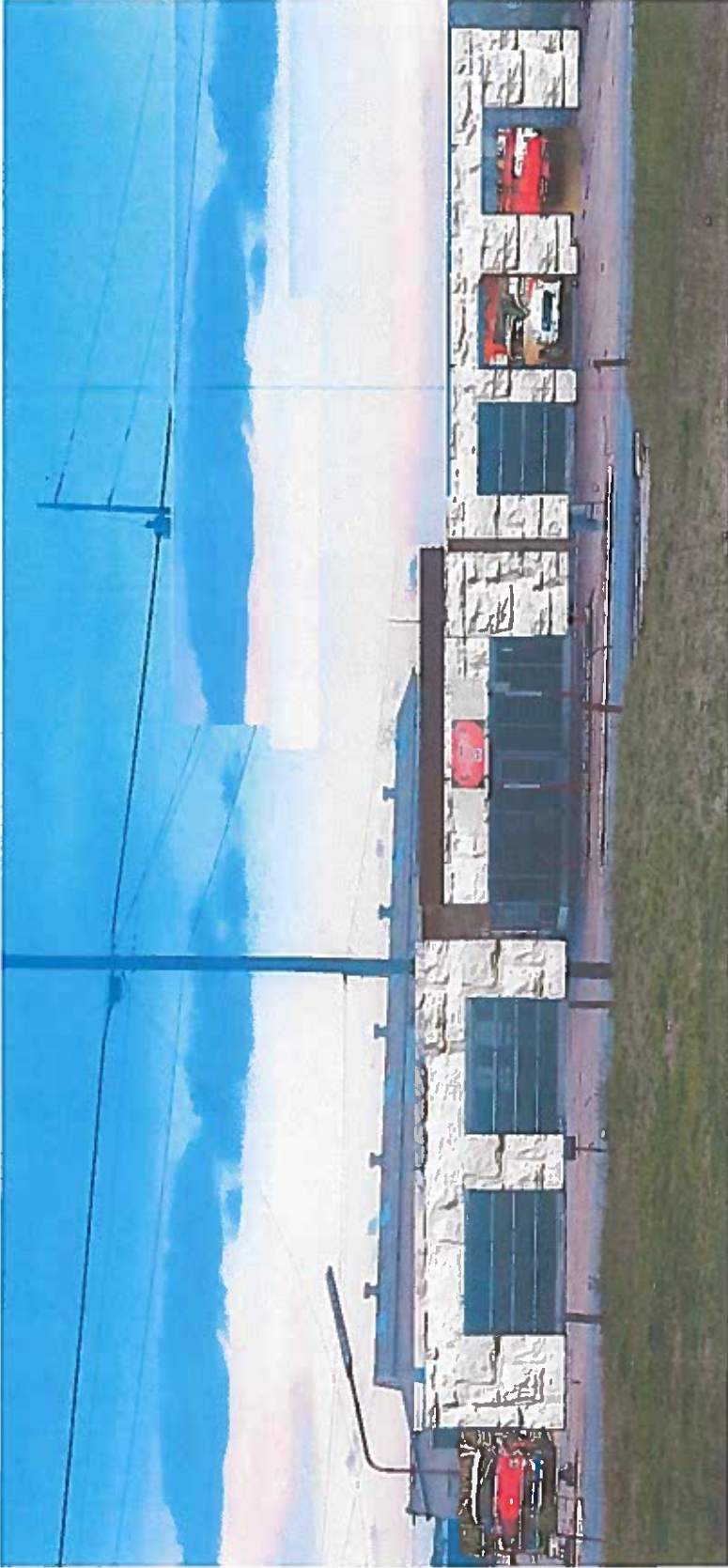
ROUGH DRAFT OF PROPOSED RENOVATIONS.