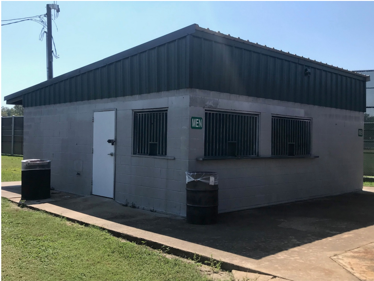
Henderson Softball Concession/Restroom Facility