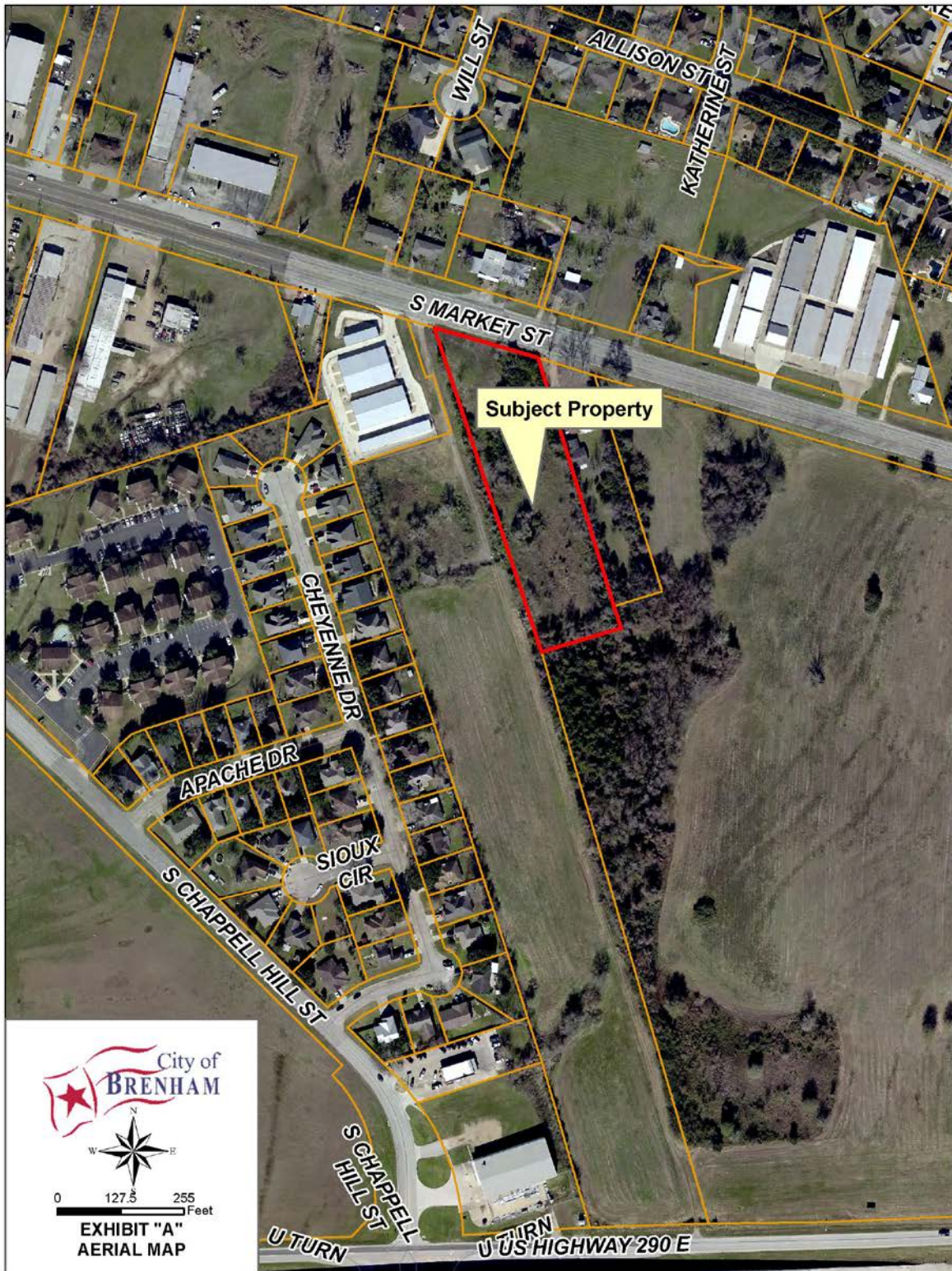
EXHIBIT "A" AERIAL MAP