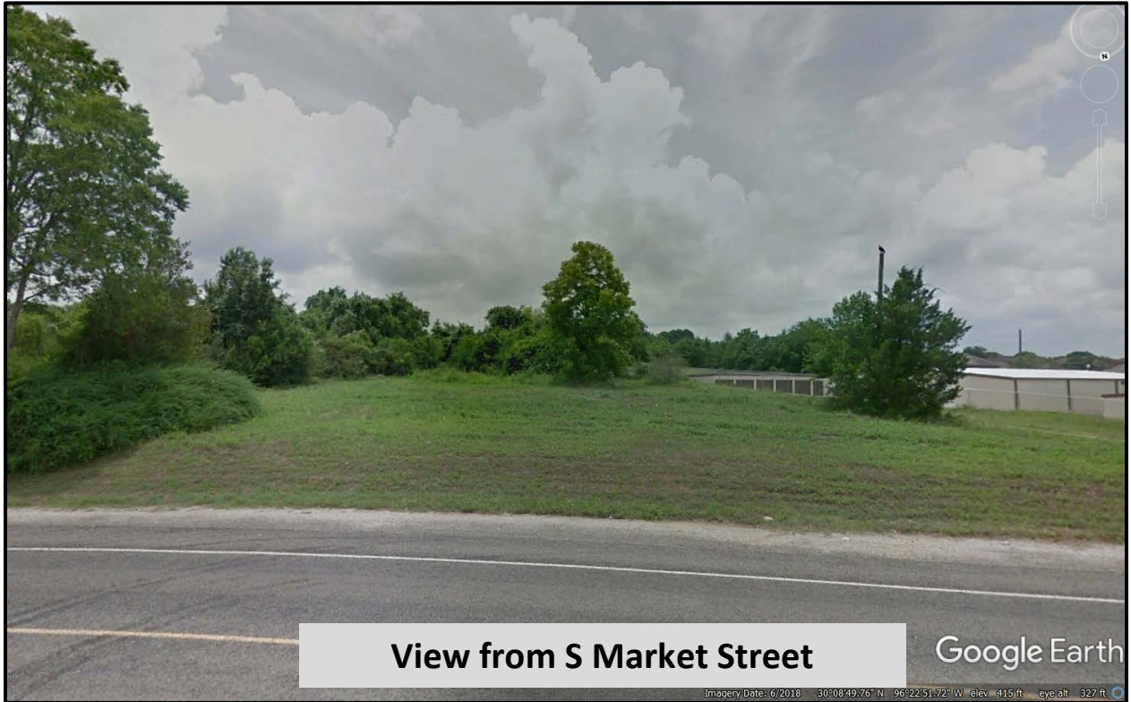
EXHIBIT "D" SITE PHOTOS