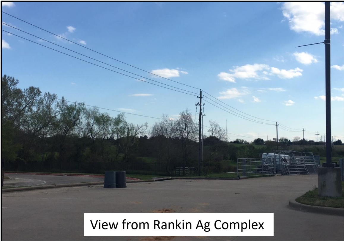
EXHIBIT "F" SITE PHOTOS