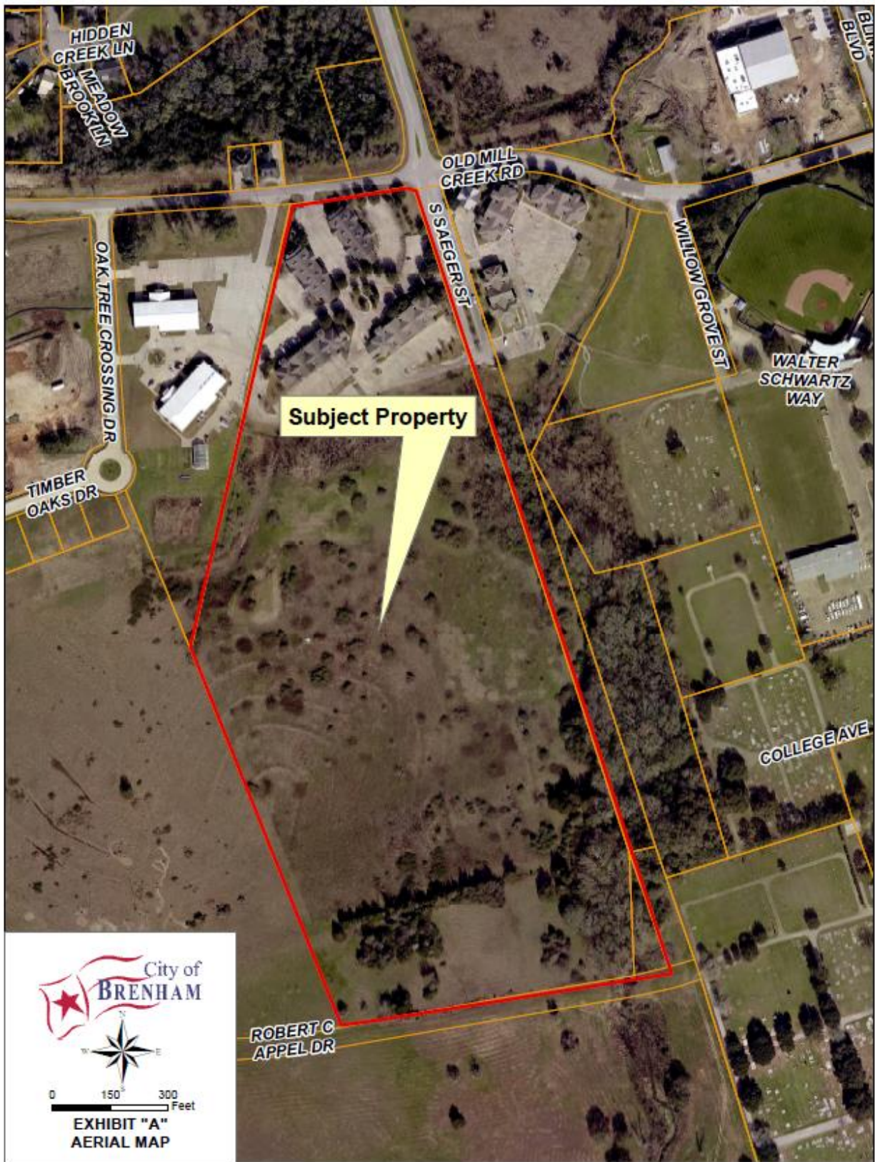
EXHIBIT "A" AERIAL MAP