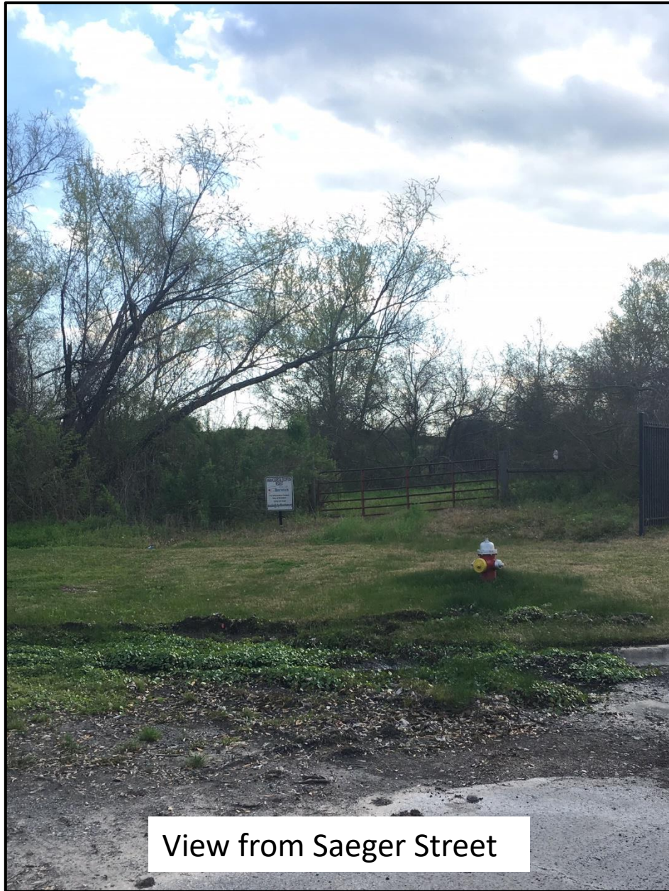
View from Saeger Street